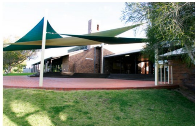
Lake Burrendong - Outside the recreation hall at Lake Burrendong.

Year 11 students attending the 2015 Access camp at Lake Burrendong need to return their permission notes and money to the front office by Friday 20th February.