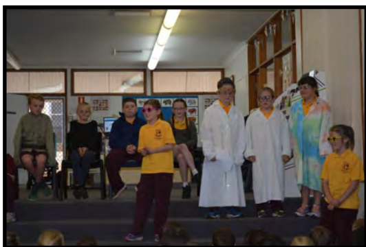
Year 3/4 performed a Readers Theatre item.

Last Friday was a fantastic primary assembly. Thank you to the teachers and students for all their hard work.