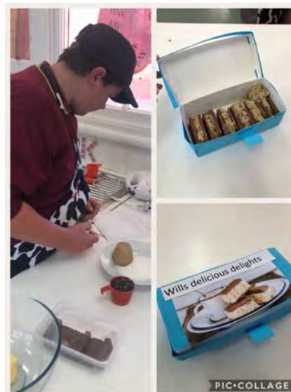
Will C fused cookie dough with Tim Tams