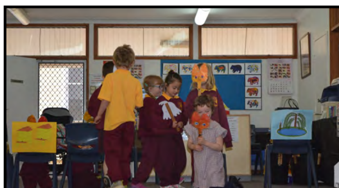
Kindergarten performing Rosie's Walk.