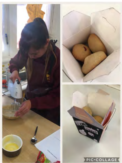
Jennet changed some ordinary cookies into red frog cookies