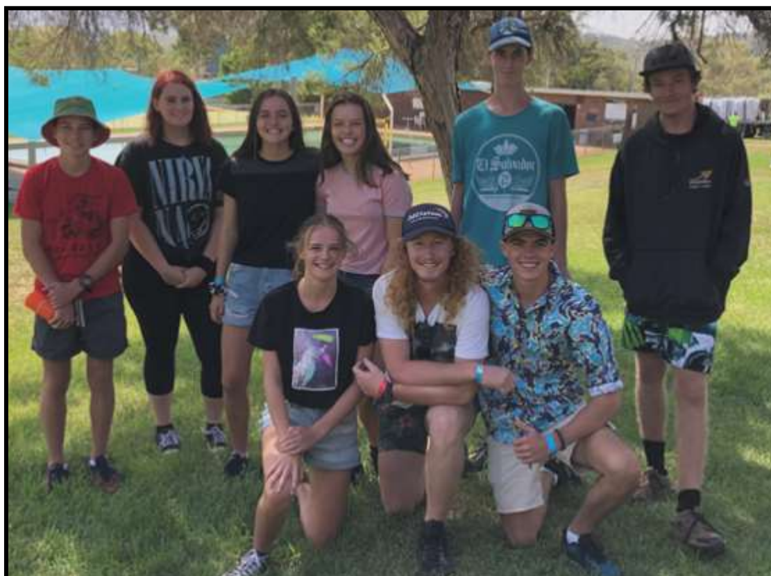
Year 11 and 12 students at the Access Camp at Lake Burrendong

We welcome all new parents to attend our meeting and encourage you to get involved. Fresh faces, fresh ideas. P&C needs you!