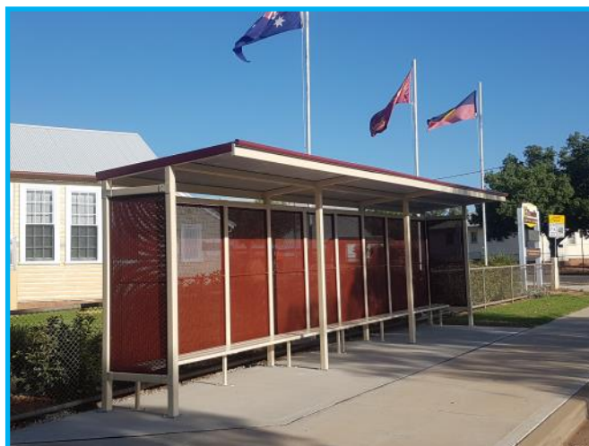
Completed bus shelter was used for the first time last Friday.