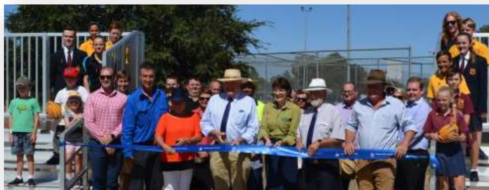
Trundle Central School students were invited to participate in the official opening of Berryman Oval after major improvements were completed from the $500K Government Grant.