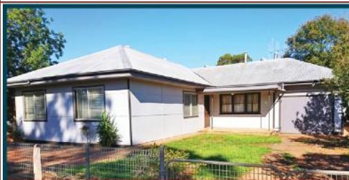
16 Gobondery St, Trundle $220,000